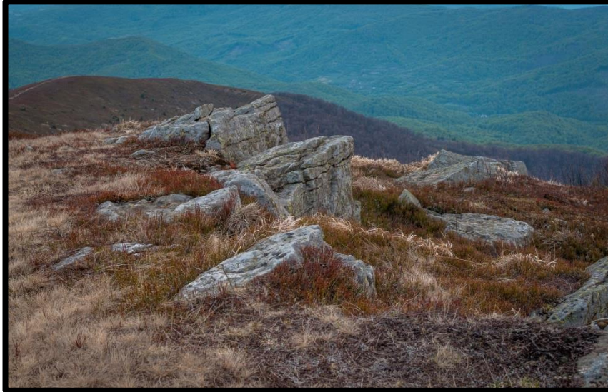
Spring in the Carpathians

Almost all of Ukraine is flat. The grassland that covers most of the central and southern parts of the country is known as the steppe. Ukraine has only two mountainous regions – the Carpathians in the west and the Crimean Mountains in the south.