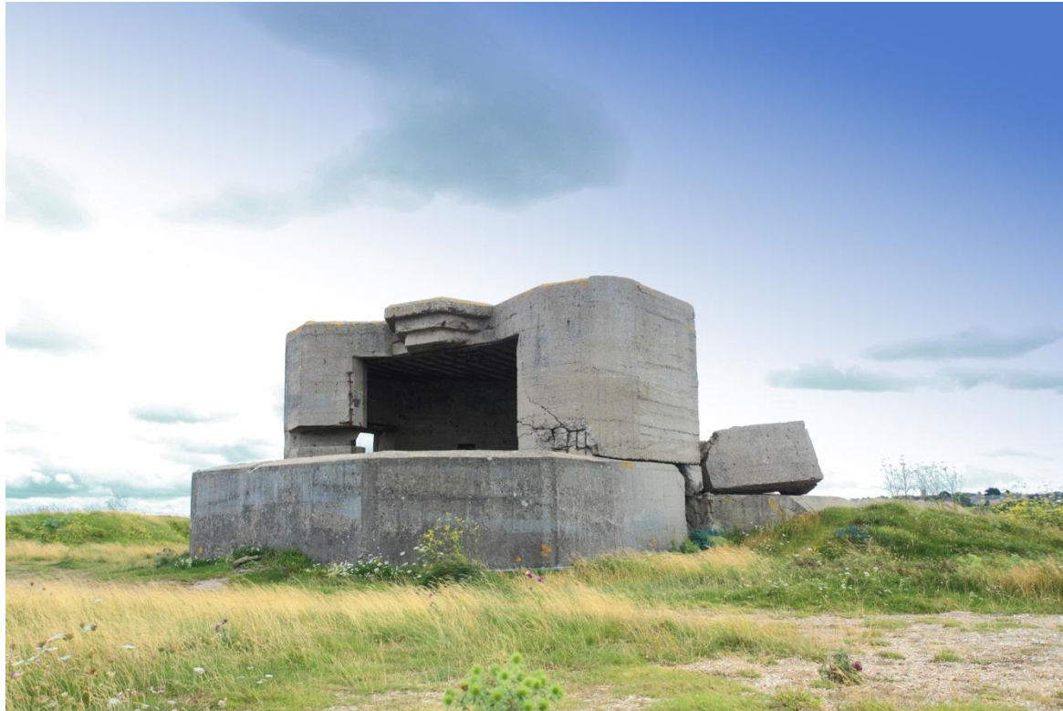
German bunker in Normandy during World War II