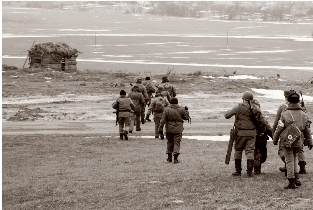
Soviet Union forces in World War II era battle