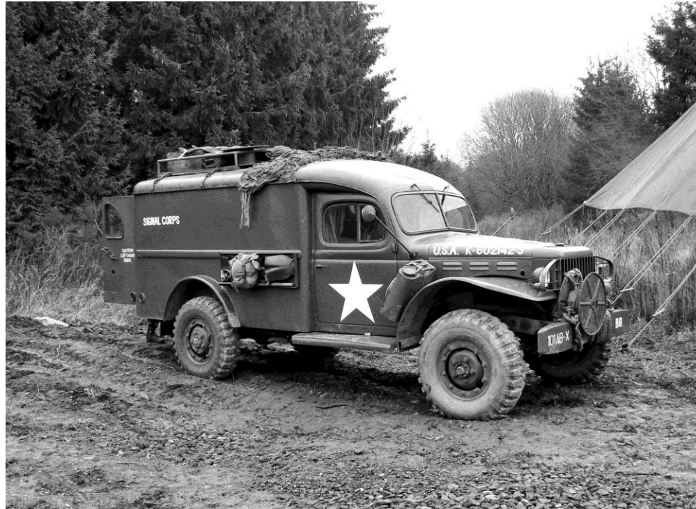
World War II military vehicle